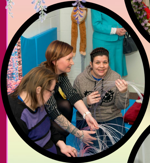
Enjoying the sensory equipment.