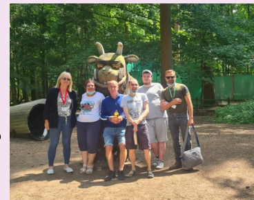
Exploring Thetford Forest with service users and other staff.

We look forward to her getting to know all our clients out and about now lockdown restrictions are being lifted.