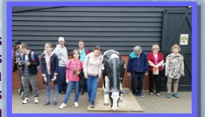
Fun at Banham Zoo

Throughout the year, in September, members have the chance to attend Joan Manns Sports day, at the USA Mildenhall Air Force Base, for a day of sport and immense fun. Other activities throughout the previous year have seen members go bowling, enjoying a train ride starting at Dereham to Wymondham on the Mid Norfolk railway, visiting Banham Zoo, celebrating Halloween and other themed days throughout the year, and in particular, a favourite of members has been the musical and Television quizzes that are held frequently, and will most certainly be continuing.