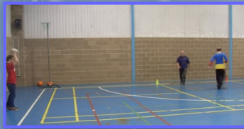
Exercising in the hall at Swaffham

Welcome to the start of a new year. We are continuing to write up about the clubs we offer throughout each year when space permits in our editions. The Saturday Club is just one. We have previously written about the Gateway Club, and Cromer Drop-in, so I thought it would be lovely to write up about the Saturday Club this month. The Saturday Club runs on the first Saturday of the month in Swaffham and the third Saturday of the month in Dereham from 10.00am – 4.00pm.