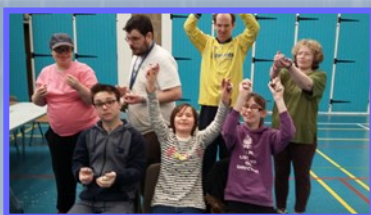
Easter Egg Hunting at Swaffham

If you wish for further information, please contact the office at Tavern Lane.