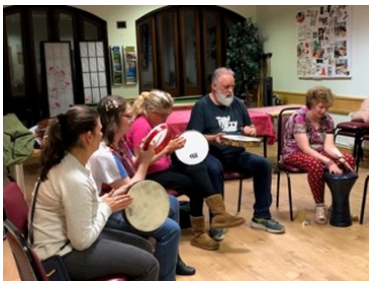
Recent visit from The Music Man and making Halloween gift boxes and Christmas wreaths.